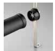
L-bracket and end plug