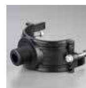
Clamp adapter (round header)

Please see our accessories catalogue for more details.