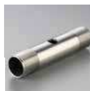
Stainless steel connector (square header)