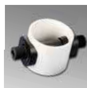
Plastic connector / Sealing saddle (round header)